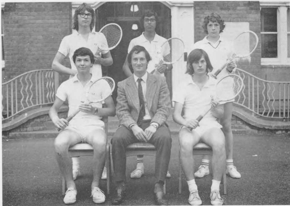
R.G.S. 1ST VI